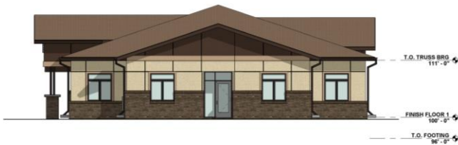
3 BUILDING ELEVATION - NORTH 1/8" = 1'-0"