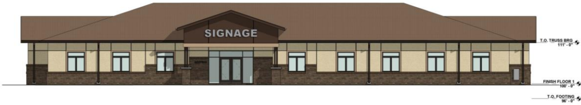
1 BUILDING ELEVATION - EAST 1/8" = 1'-0"