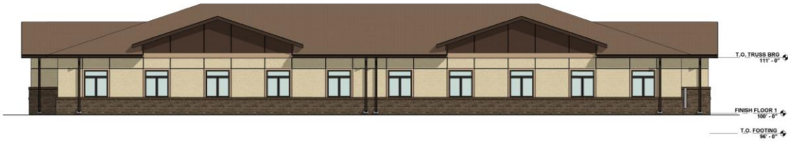
2 BUILDING ELEVATION - WEST 1/8" = 1'-0"