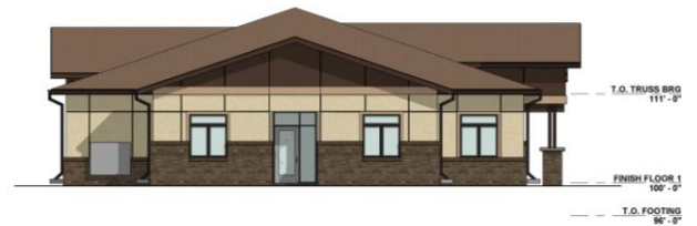
4 BUILDING ELEVATION - SOUTH 1/8" = 1'-0"