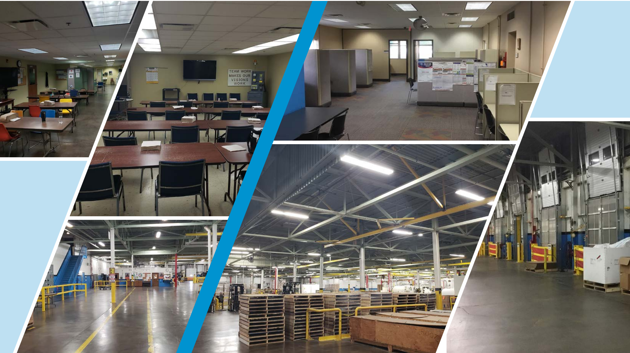
CLOCKWISE FROM TOP LEFT: Break Room, Office Training Room, Office Area, Loading Dock Doors, Interior Warehouse Area