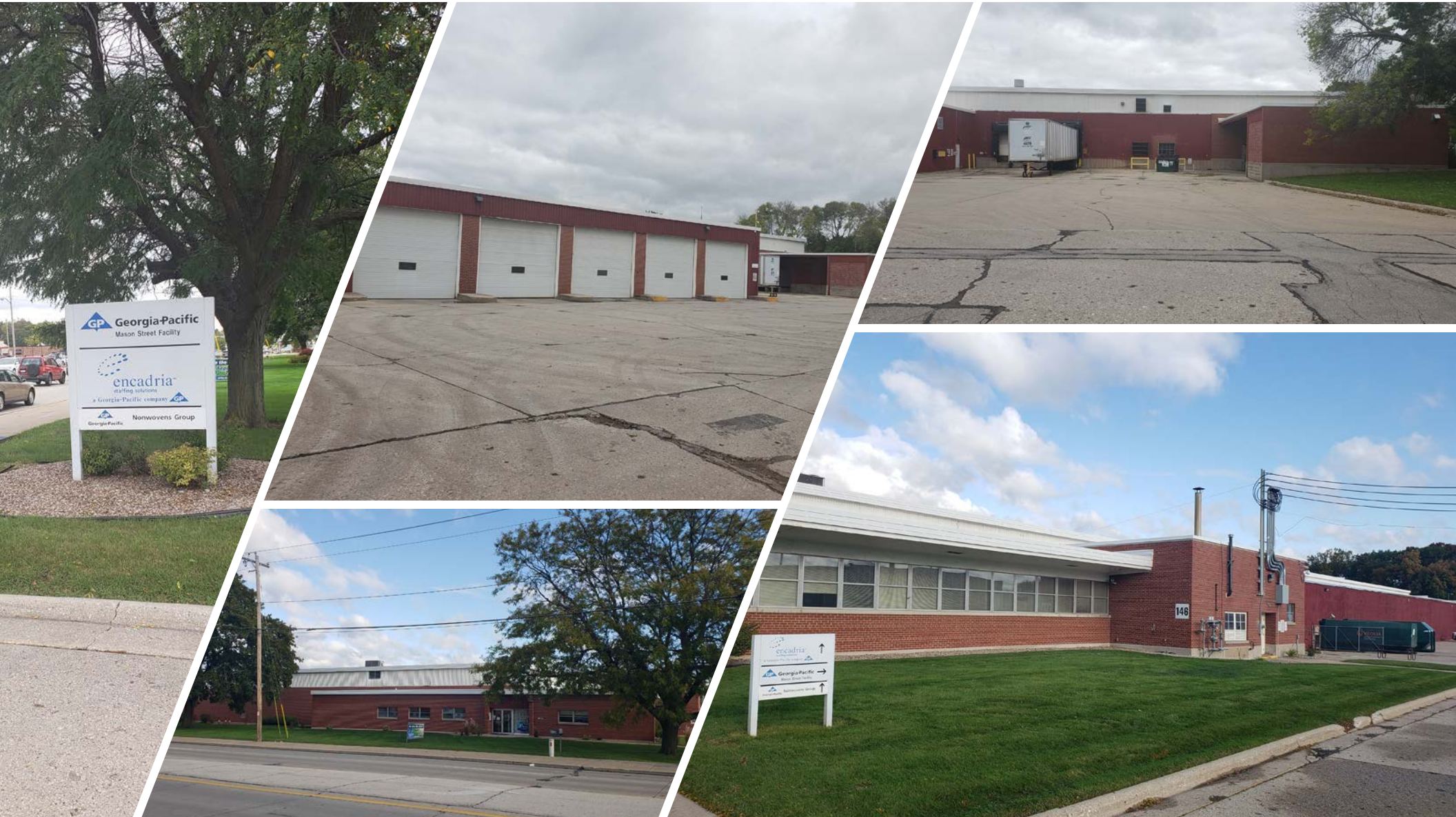
CLOCKWISE FROM TOP LEFT: Signage in front of building, Interior Docks and Loading Court, Truck Docks, Front of Building, Side Entrance