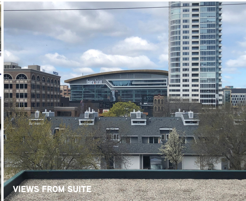
VIEWS FROM SUITE