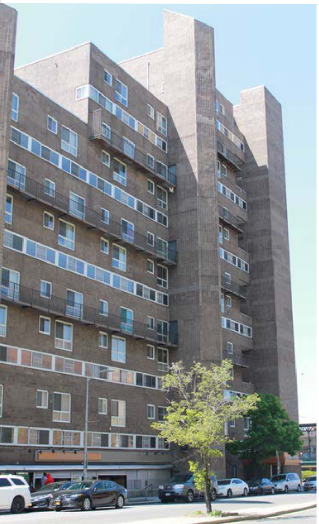
69 Riverdale 806 SF