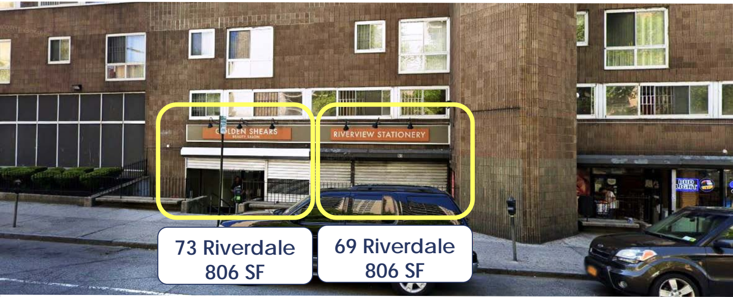
73 Riverdale 806 SF