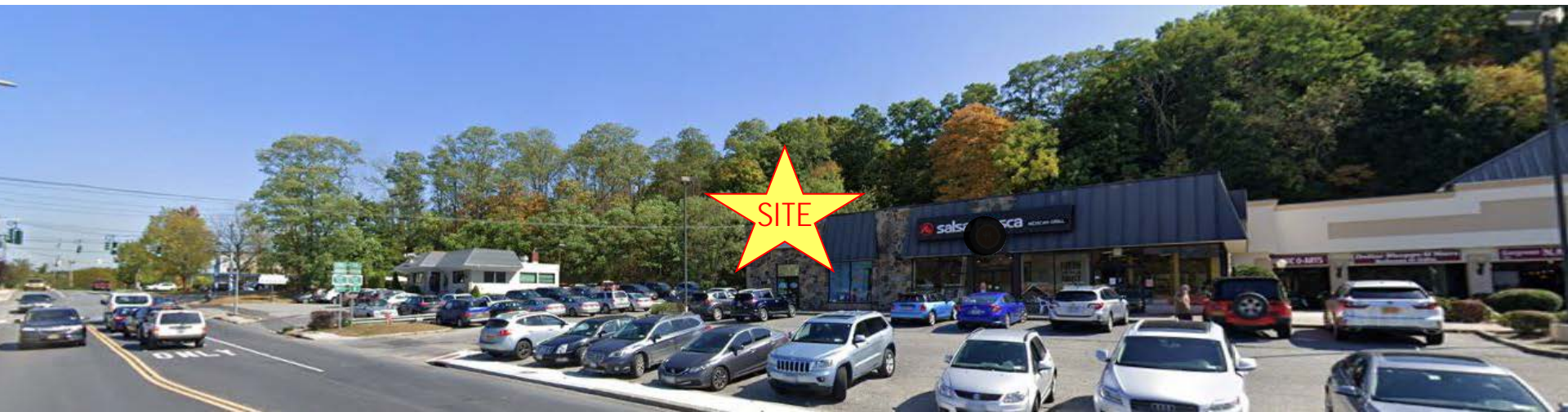
Facing North on Bedford Road toward Bedford Hills