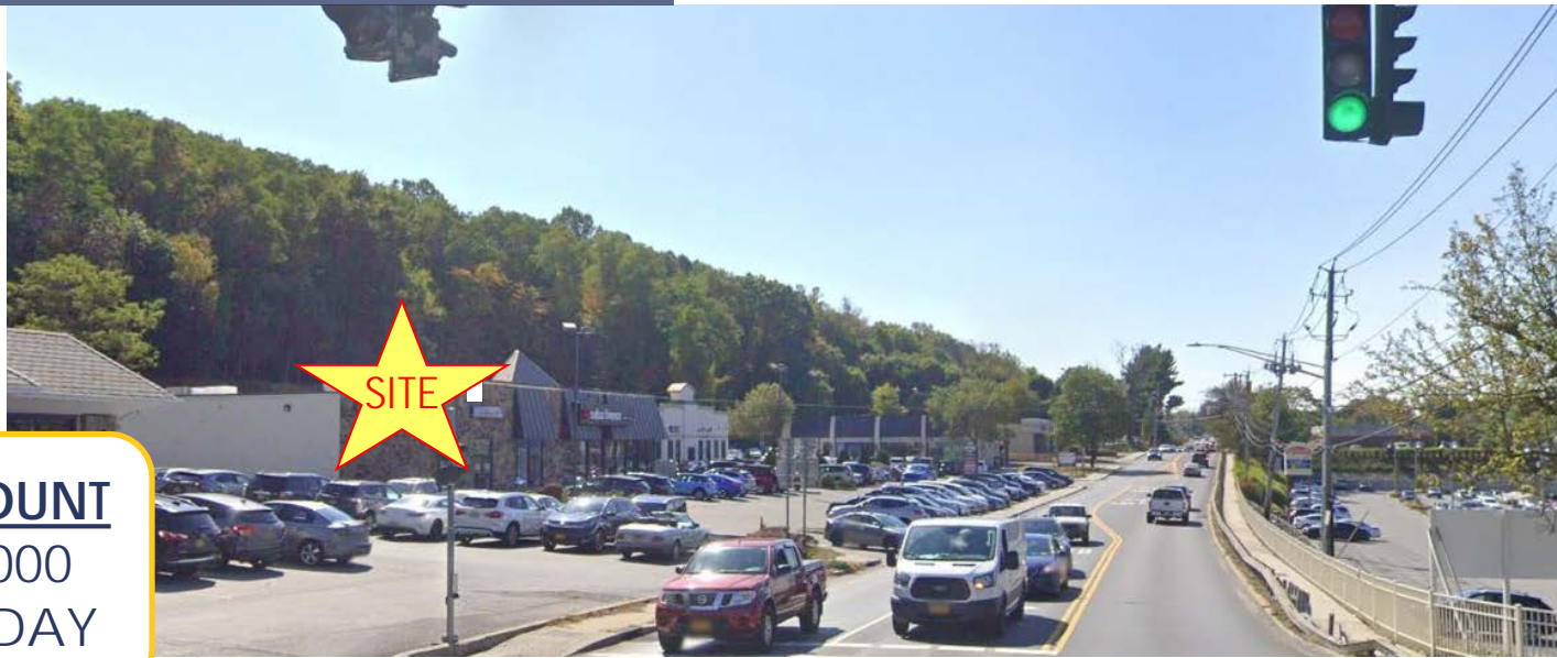
At Light of Green Lane Facing South toward Mt Kisco