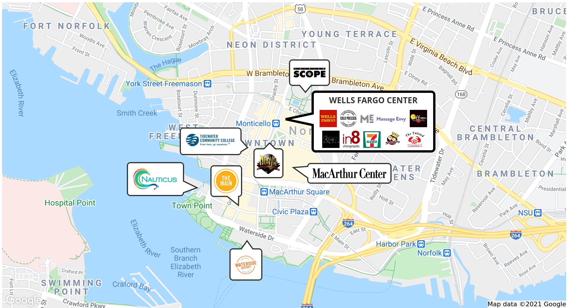
Map data ©2021 Google

S.L. NUSBAUM REALTY CO. | 1700 WELLS FARGO CENTER, 440 MONTICELLO AVENUE, NORFOLK, VA 23510 | 757.627.8611 | SLNUSBAUM.COM