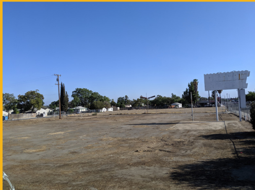
620 N Chester Avenue