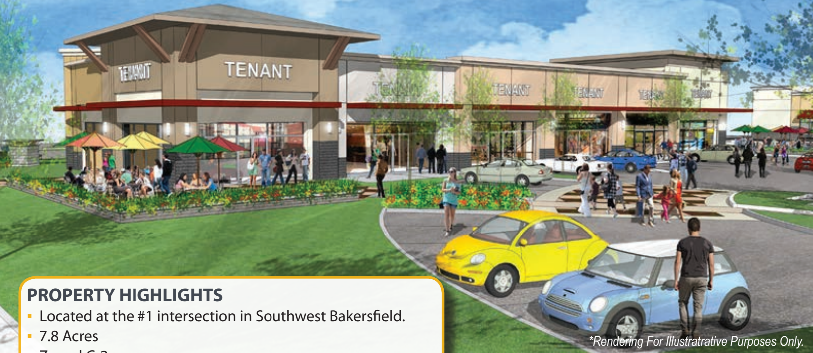
*Rendering For Illustrative Purposes Only.