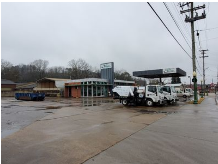
Store Front of 3011 Dayton Blvd