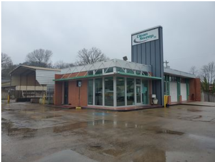
Store Front of 3011 Dayton Blvd