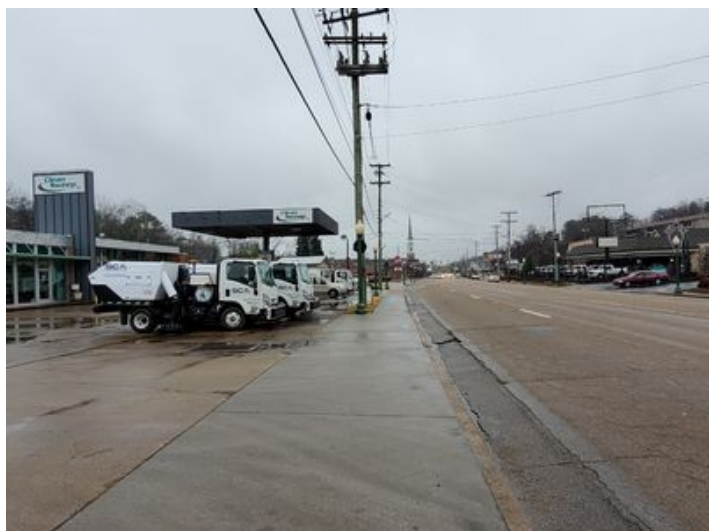
Street View on Dayton Blvd