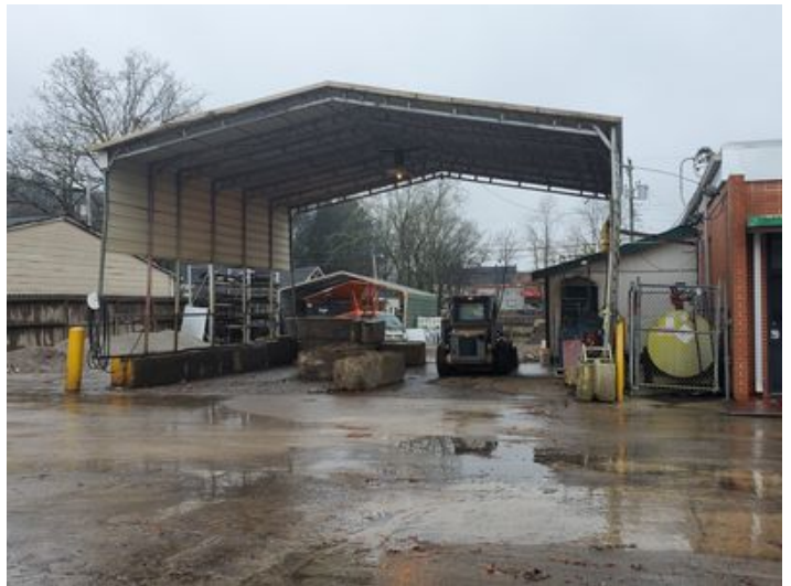
Side View of Shed Area (1)