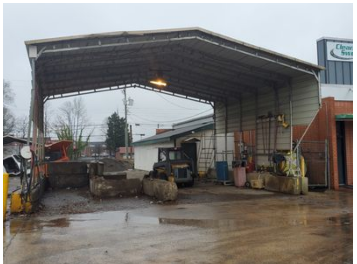
Side View of Shed Area (2)