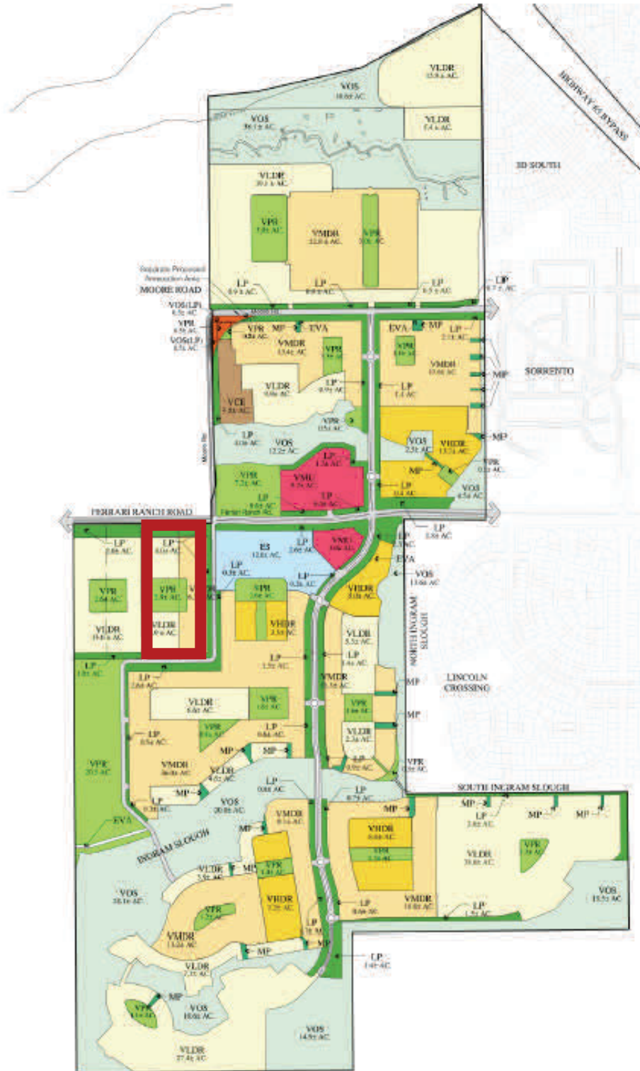
Figure 4-1: Land Use Plan