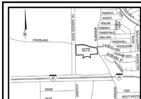
VICINITY MAP NOT TO SCALE GRAND PRAIRIE, TEXAS