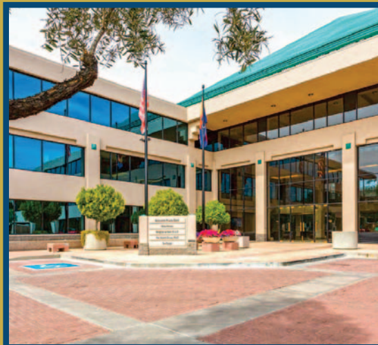
Gainey Ranch | Scottsdale, AZ | gaineyranchcorporatecenter.com