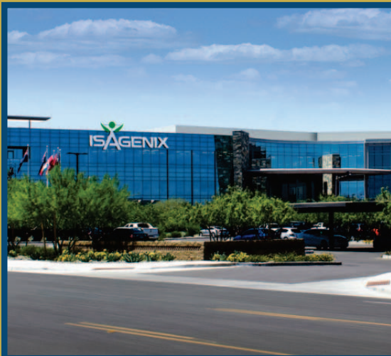
Rivulon | Gilbert, AZ | rivulon.com