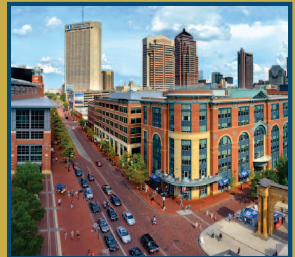
Arena District | Columbus, OH | arenadistrict.com

Nationwide Realty Investors is the real estate development affiliate of Nationwide Insurance, and is nationally recognized as one of the country's leading developers of large, complex, mixed-use projects.