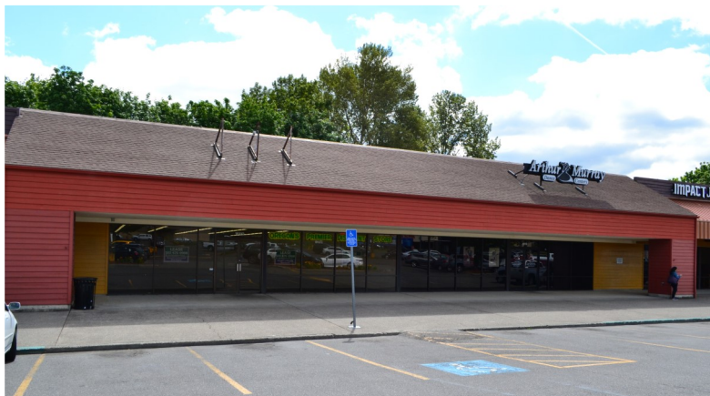
Suite 16110—5,244 SF