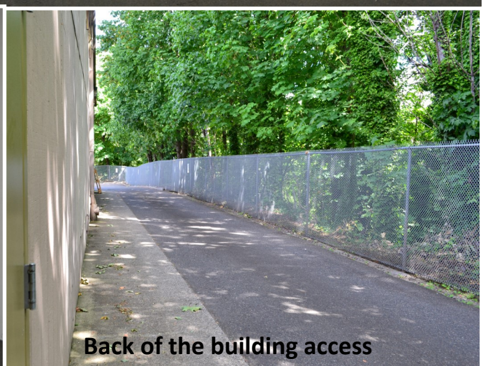
Back of the building access