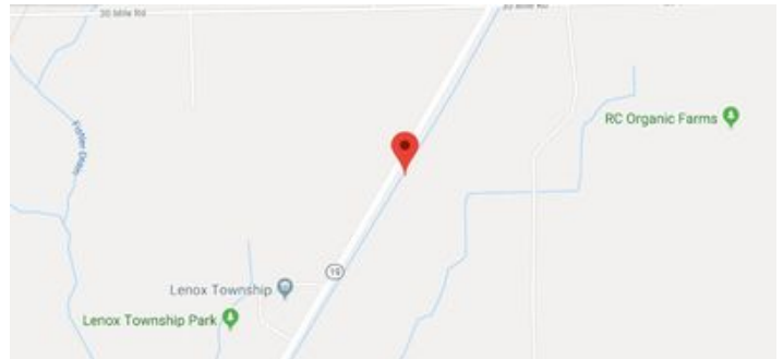
0 Gratiot 3 half ac 1