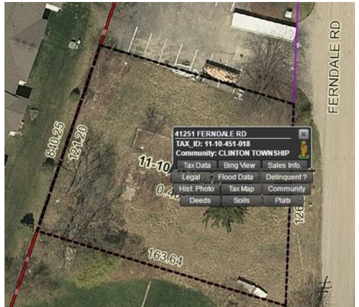
101 Groesbeck 2