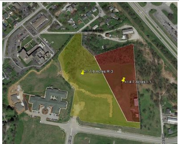
Crossfield R-3 I-1 map