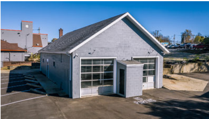
103 N Madison Ave-05