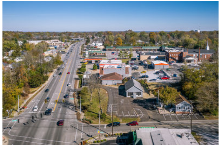
103 N Madison Ave-09