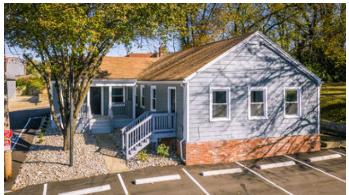
103 N Madison Ave-04