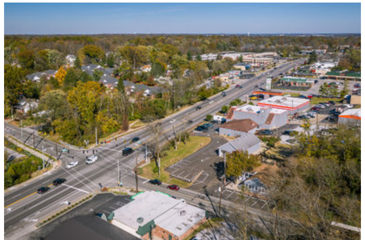
103 N Madison Ave-10