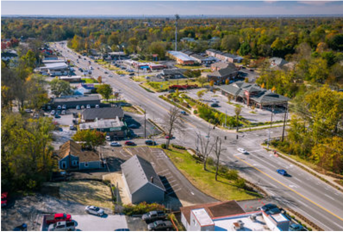
103 N Madison Ave-11