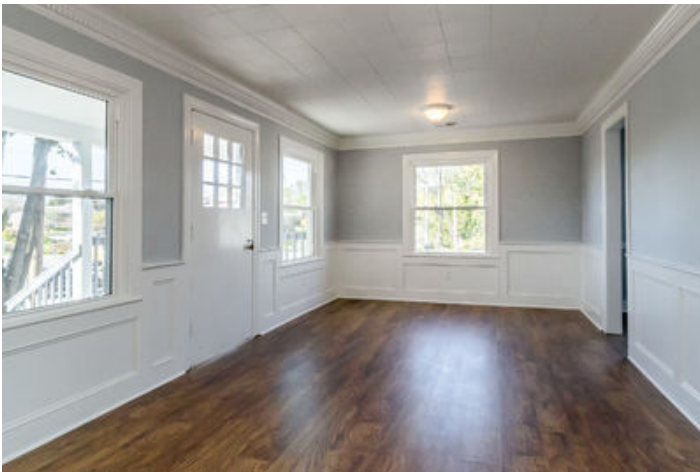
103 N Madison Ave-28