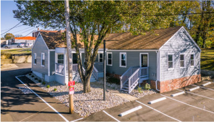
103 N Madison Ave-03