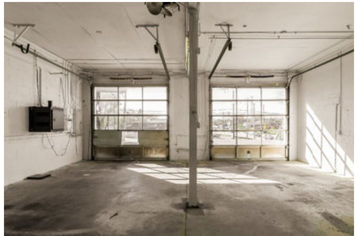
103 N Madison Ave-20