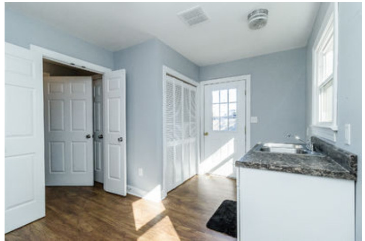
103 N Madison Ave-30