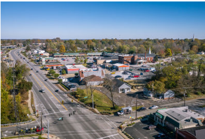
103 N Madison Ave-08