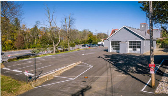
103 N Madison Ave-06