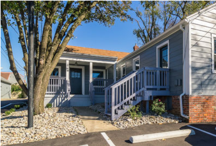
103 N Madison Ave-14