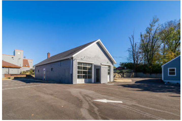
103 N Madison Ave-19