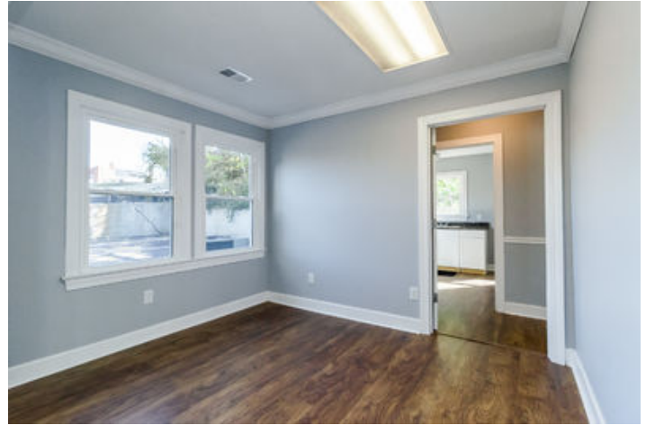
103 N Madison Ave-29