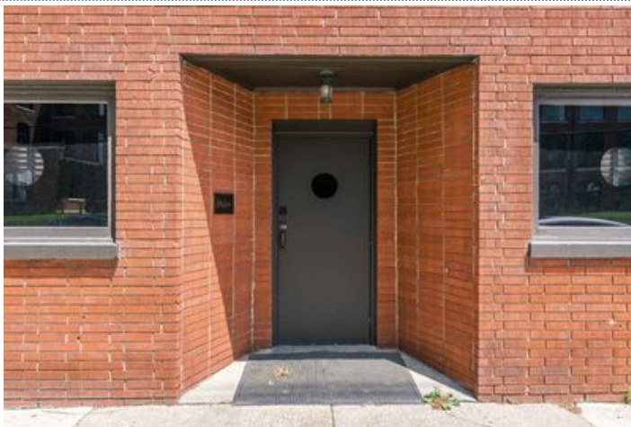
935 Goss Ave-11