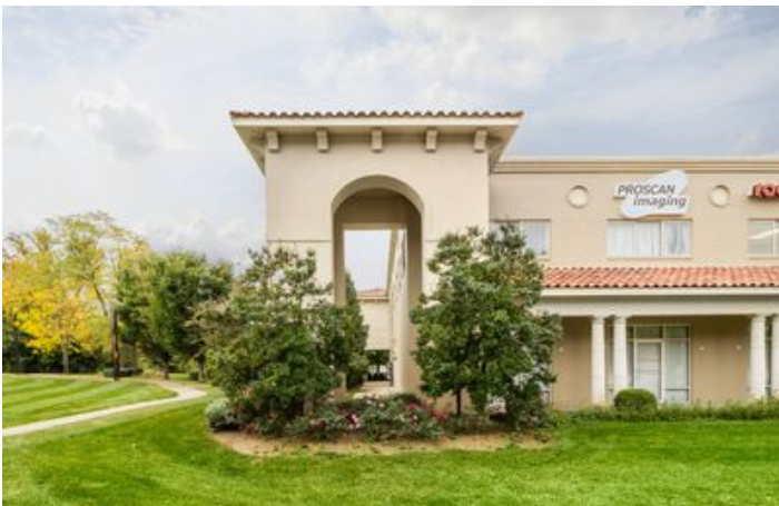
0029200 Taylorsville Rd-FULL