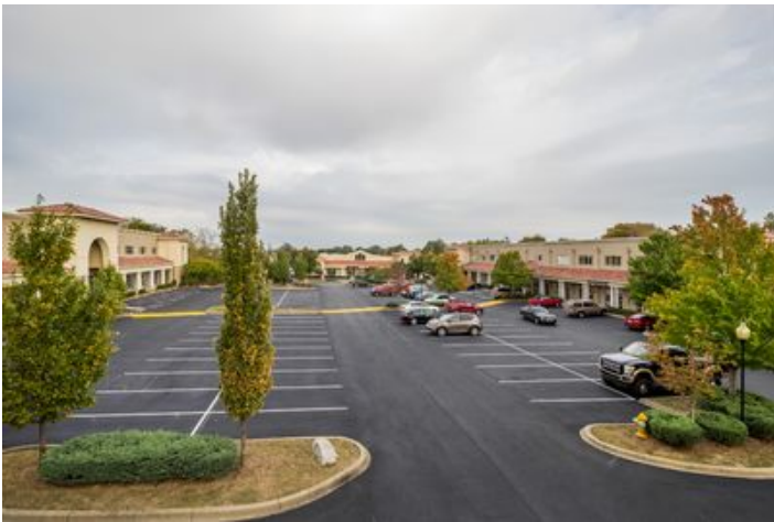
0139200 Taylorsville Rd-FULL