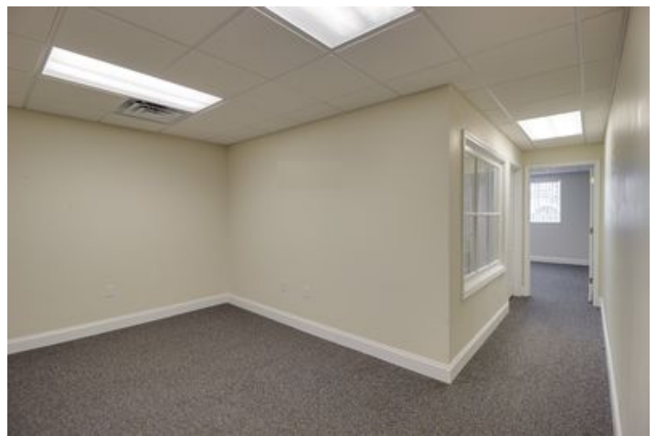
0229200 Taylorsville Rd-FULL