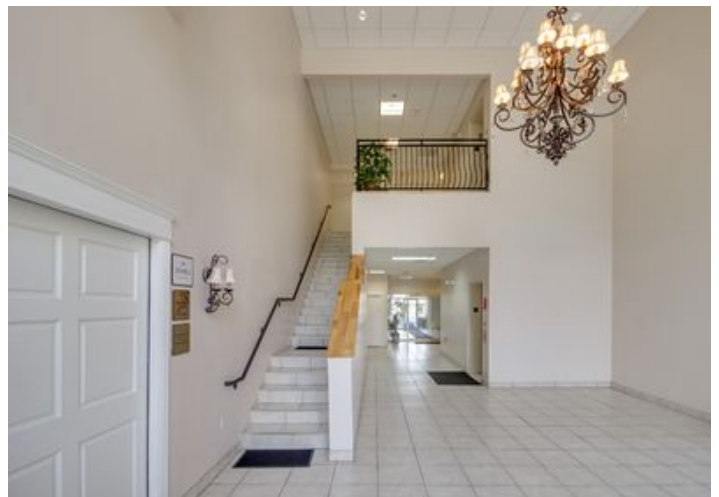
0169200 Taylorsville Rd-FULL (1)