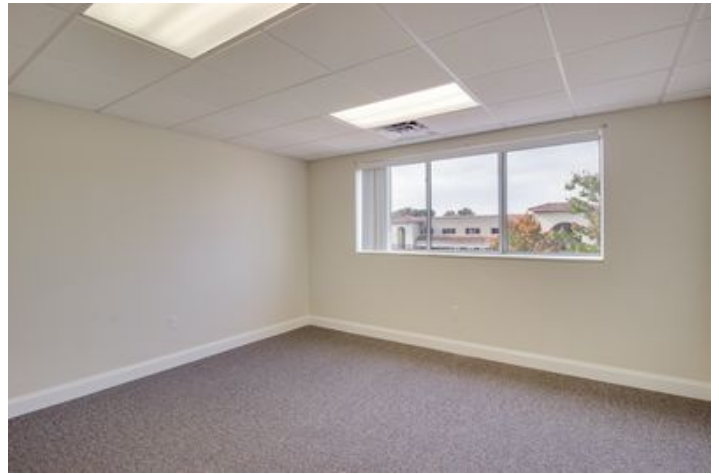
0249200 Taylorsville Rd-FULL