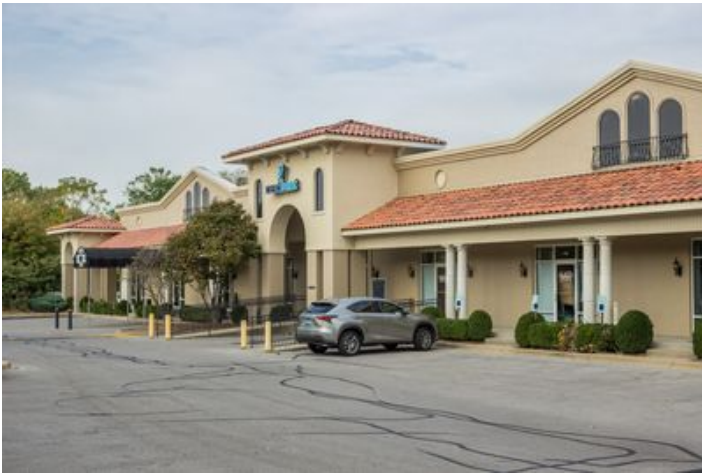
0129200 Taylorsville Rd-FULL