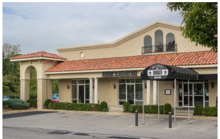
0099200 Taylorsville Rd-FULL