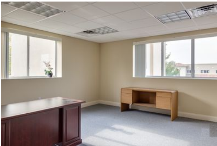
0269200 Taylorsville Rd-FULL