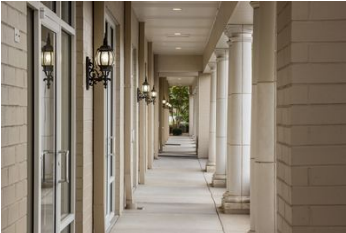
0059200 Taylorsville Rd-FULL