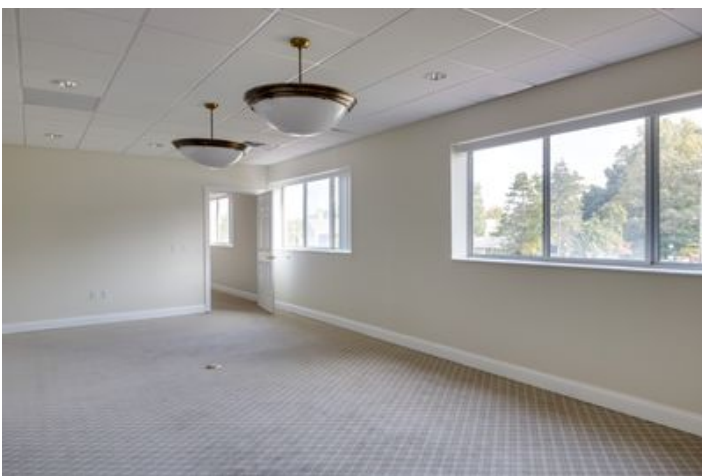
0209200 Taylorsville Rd-FULL