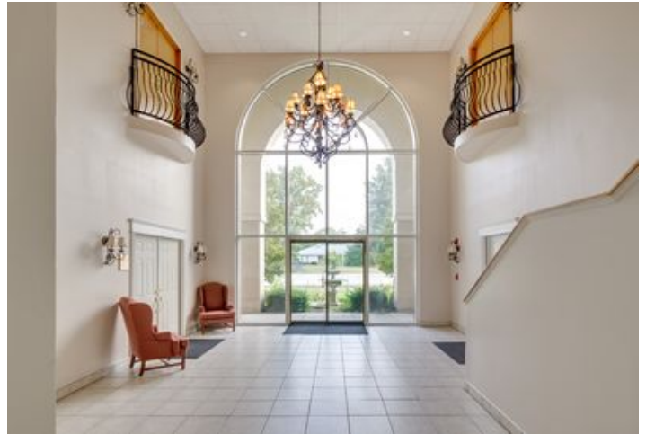
0159200 Taylorsville Rd-FULL