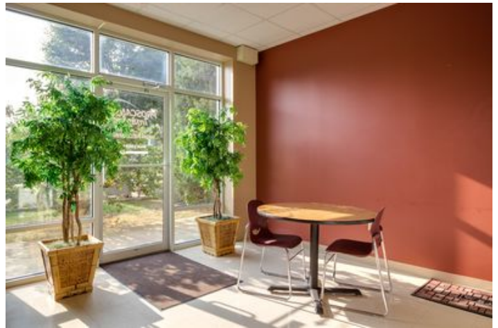
0179200 Taylorsville Rd-FULL