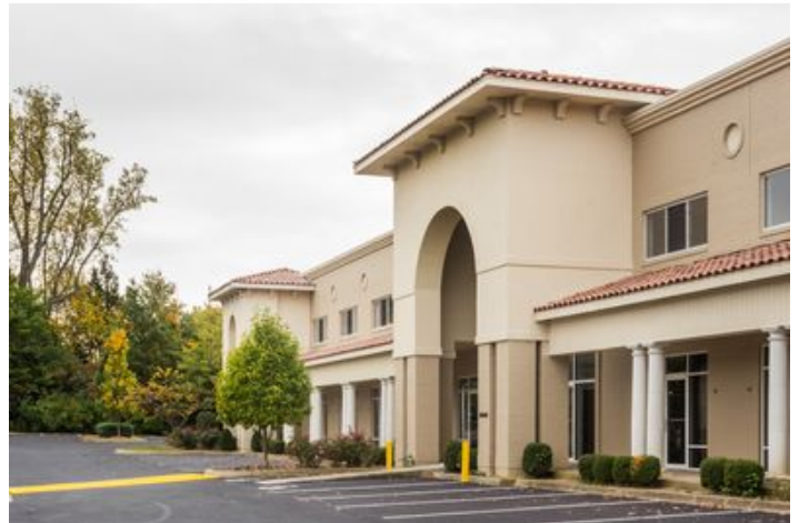
0079200 Taylorsville Rd-FULL