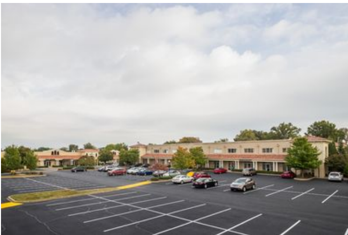
0149200 Taylorsville Rd-FULL