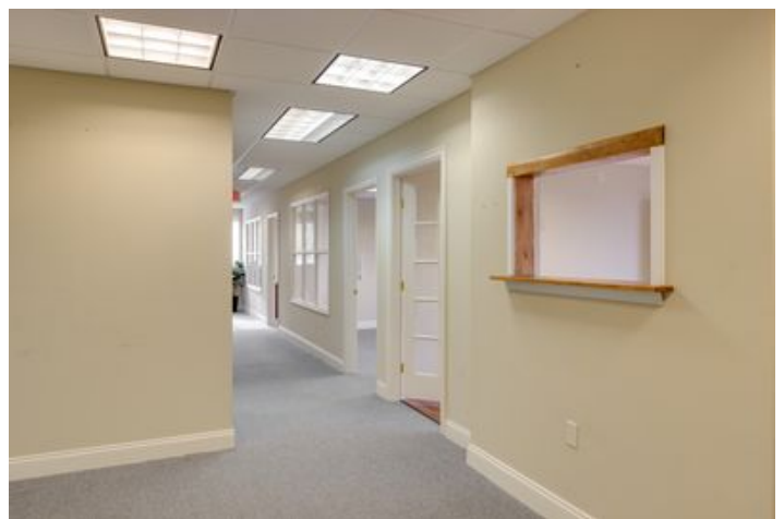
0259200 Taylorsville Rd-FULL