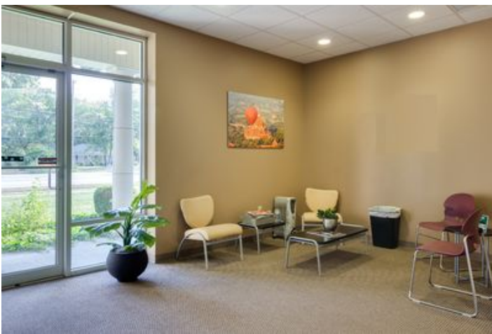
0199200 Taylorsville Rd-FULL