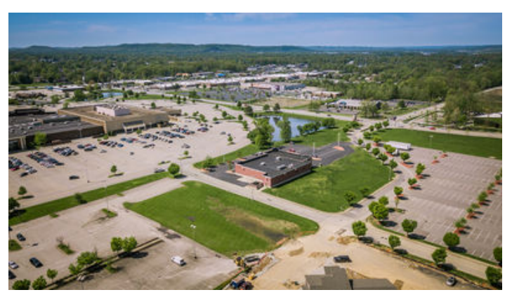
7311 Jefferson Blvd-07