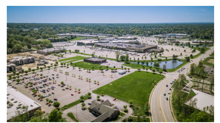
7311 Jefferson Blvd-03