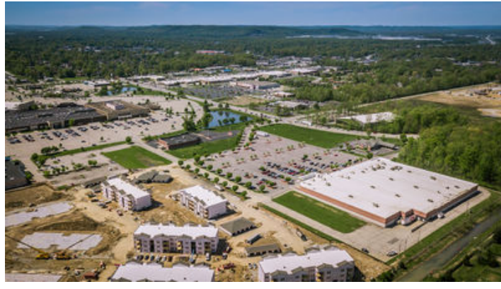
7311 Jefferson Blvd-05