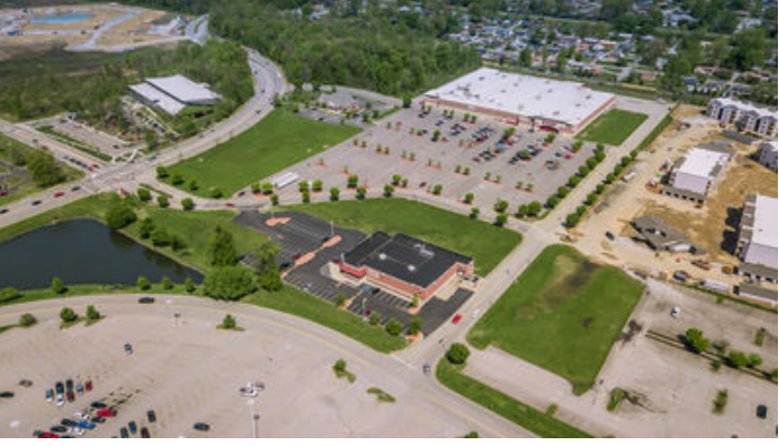
7311 Jefferson Blvd-09