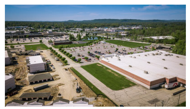
7311 Jefferson Blvd-04