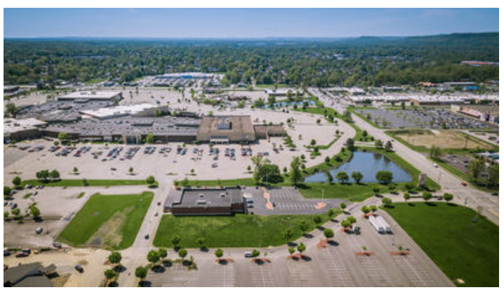
7311 Jefferson Blvd-11