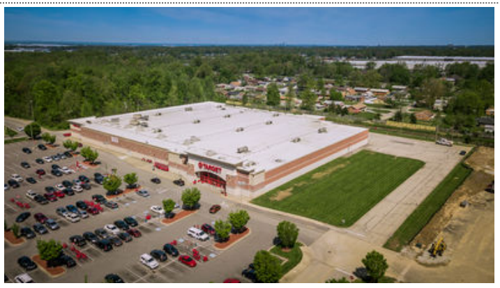
7311 Jefferson Blvd-06