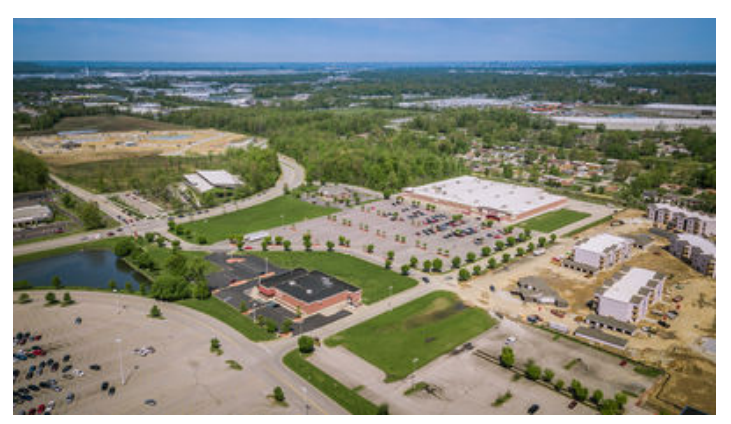
7311 Jefferson Blvd-08