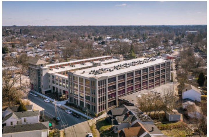
1124 Reutlinger Ave-05