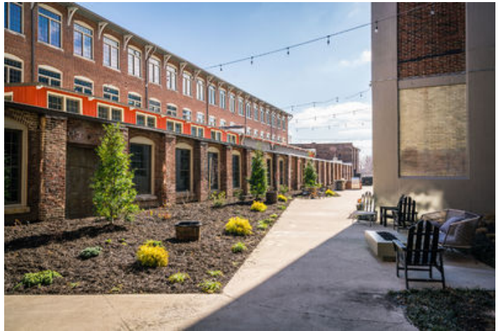
1124 Reutlinger Ave-10