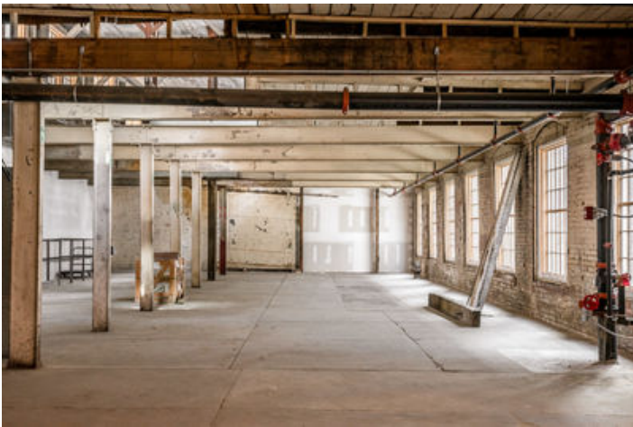
1124 Reutlinger Ave-36