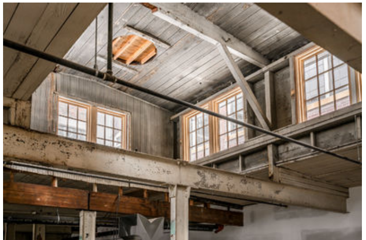
1124 Reutlinger Ave-38