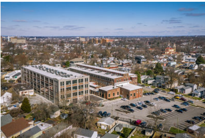
1124 Reutlinger Ave-03