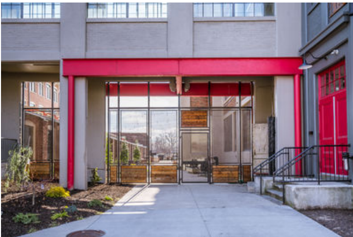
1124 Reutlinger Ave-09