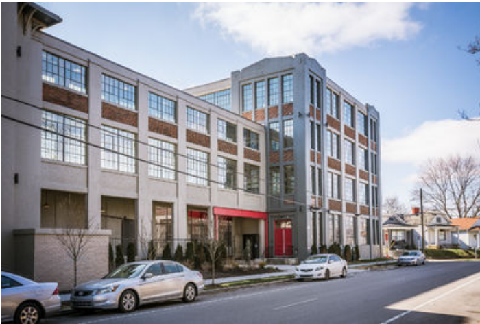
1124 Reutlinger Ave-08