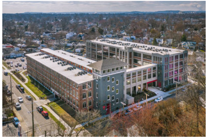
1124 Reutlinger Ave-04