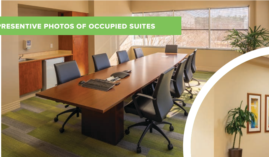
REPRESENTATIVE PHOTOS OF OCCUPIED SUITES