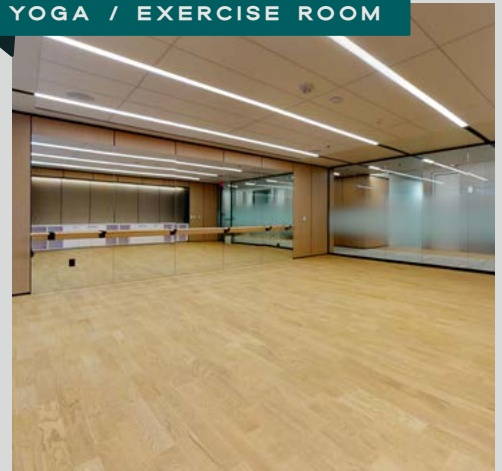
YOGA / EXERCISE ROOM