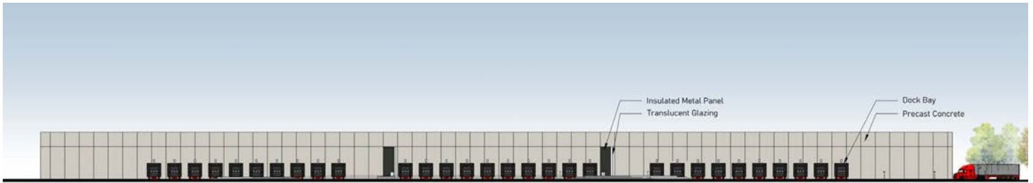
1 Back Elevation Scale: 1" = 64'-0"