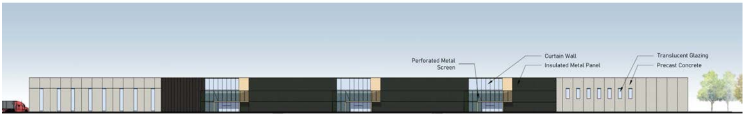
2 Front Elevation Scale: 1" = 64'-0"