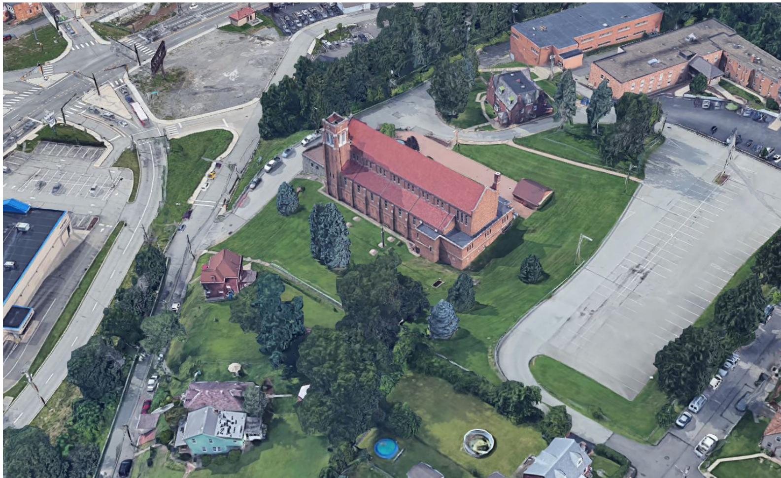
ST NORBERT'S CHURCH 2415 ST. NORBERT STREET, PITTSBURGH, PA 15234