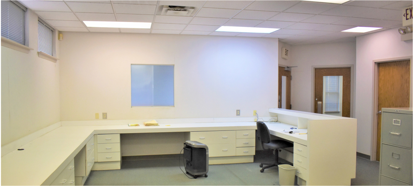
Suite A | Reception area