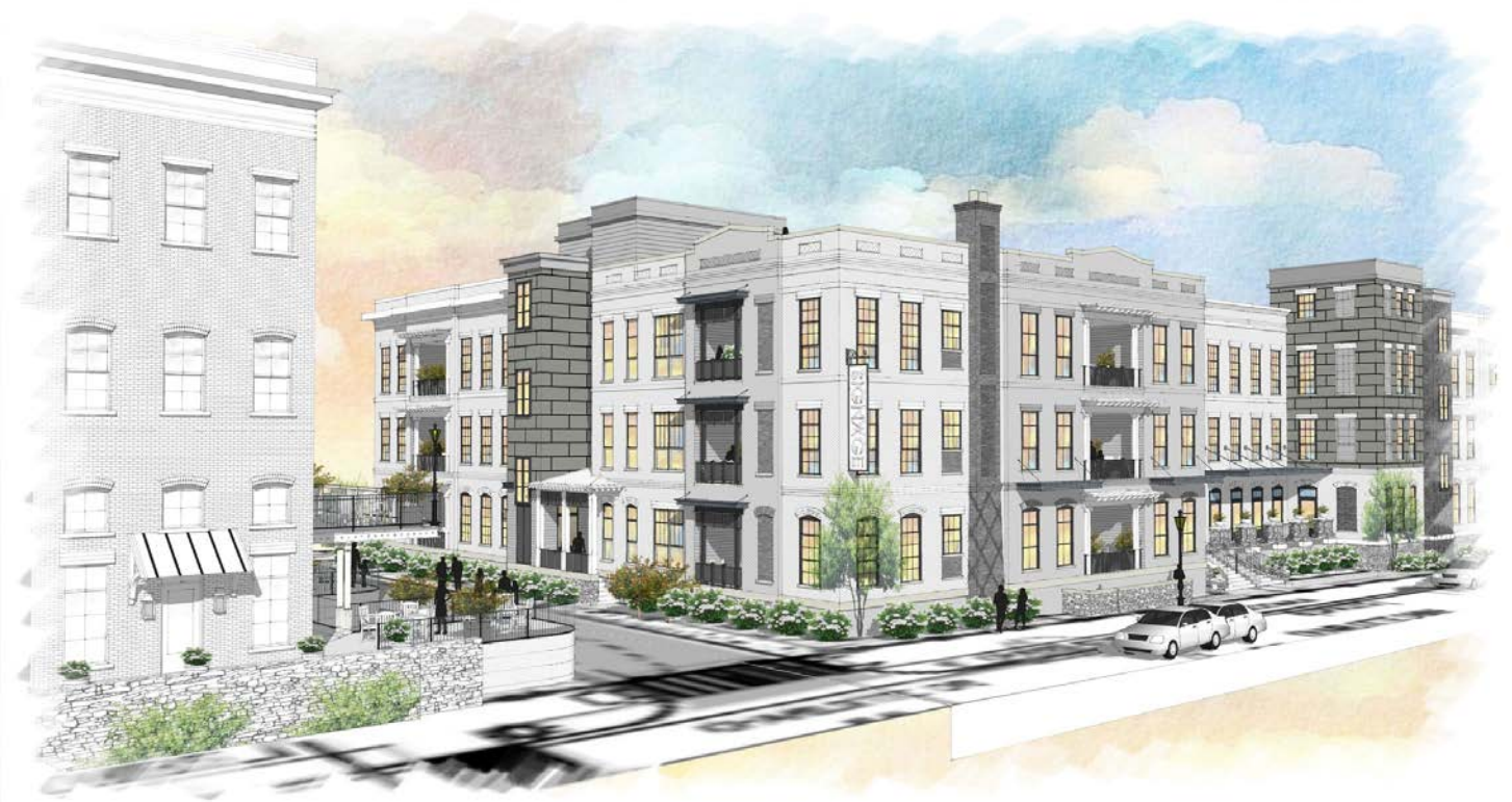
Building 3 Rendering