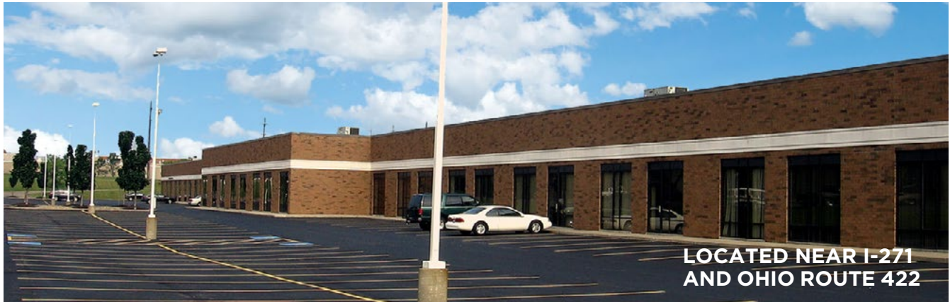
LOCATED NEAR I-271 AND OHIO ROUTE 422