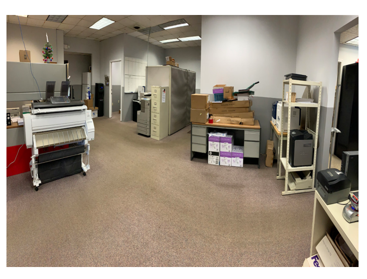
Independently Owned and Operated / A Member of the Cushman & Wakefield Alliance

Cushman & Wakefield Copyright 2020. No warranty or representation, express or implied, is made to the accuracy or completeness of the information contained herein, and same is submitted subject to errors, omissions, change of price, rental or other conditions, withdrawal without notice, and to any special listing conditions imposed by the property owner(s). As applicable, we make no representation as to the condition of the property (or properties) in question.