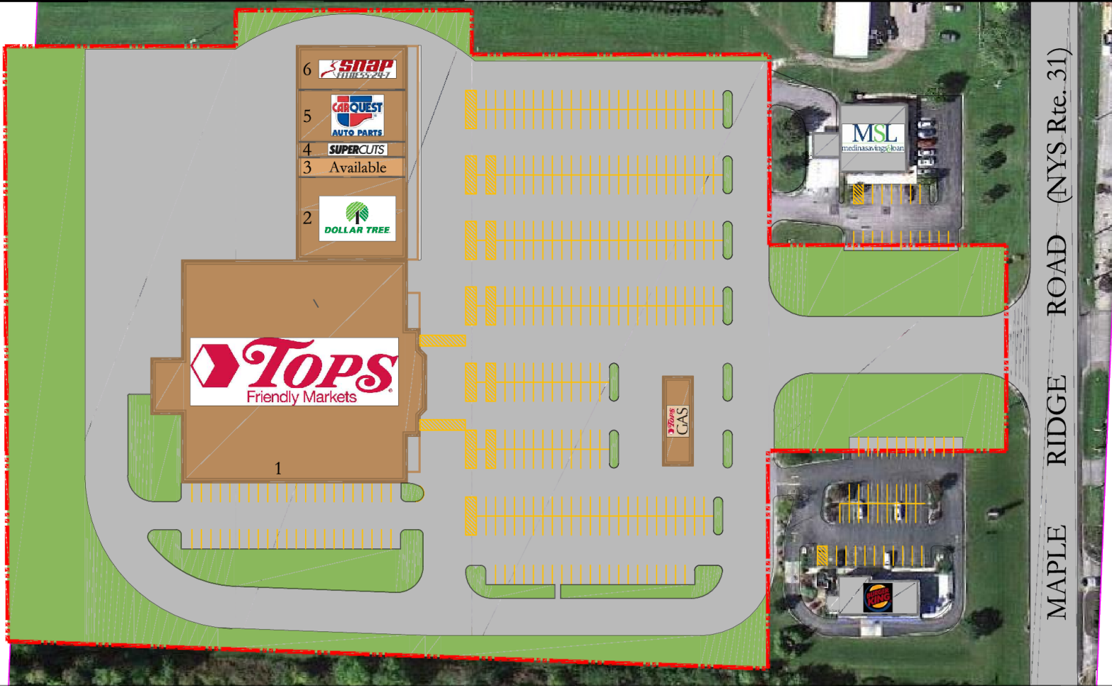
Site Plan 1"=100'

11200 Maple Ridge Road, Medina, NY 14103