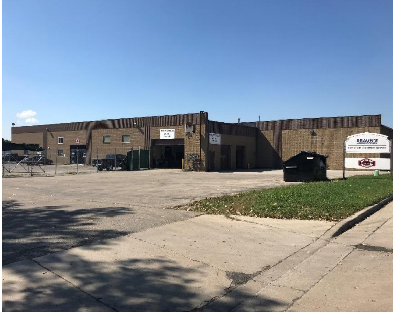
ENTRANCE - 6606 N 76 TH ST