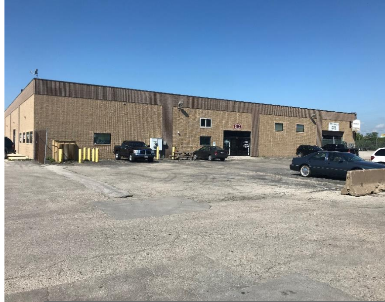
ENTRANCE - 6606 N 76 TH ST