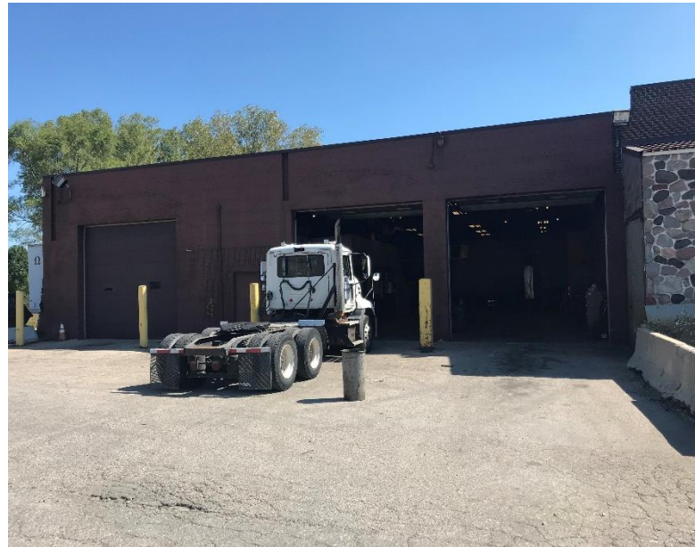
DRIVE-INS - 7320 N FLORIST