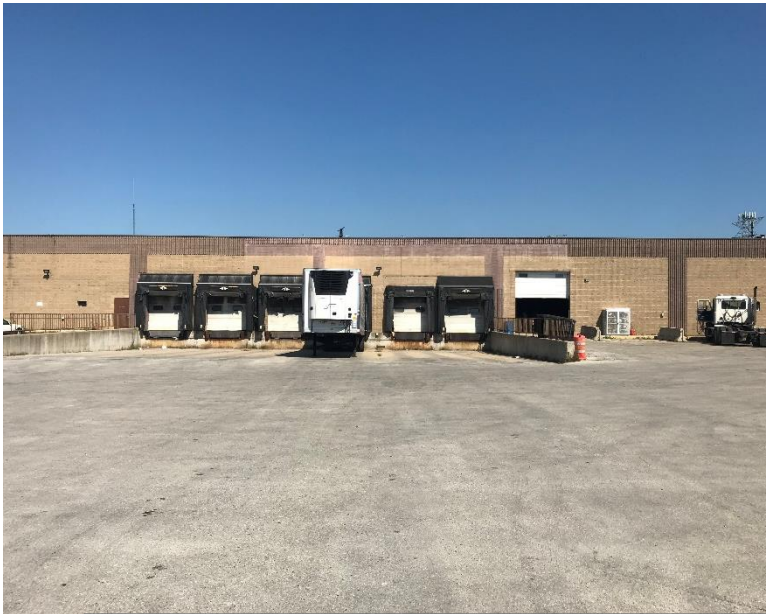
DOCKING AREA - 6606 N 76 TH ST