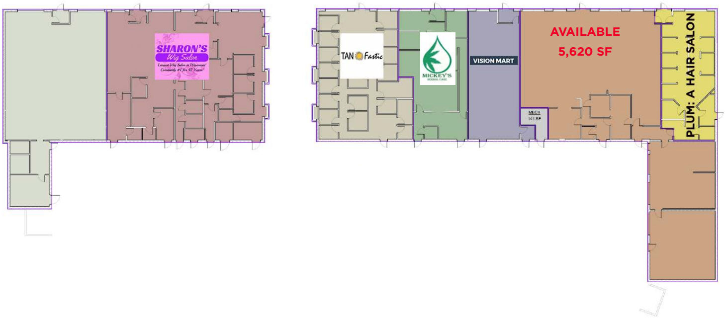
AREAS PLAN 3/20 - 1'-0"

Nathan Powers Principal 414.203.3035 npowers@boerke.com