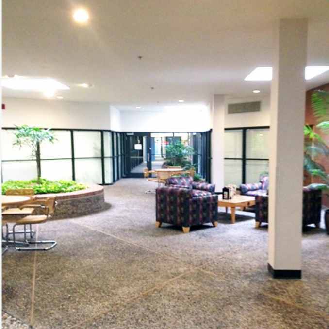
LOBBY & COMMON AREA