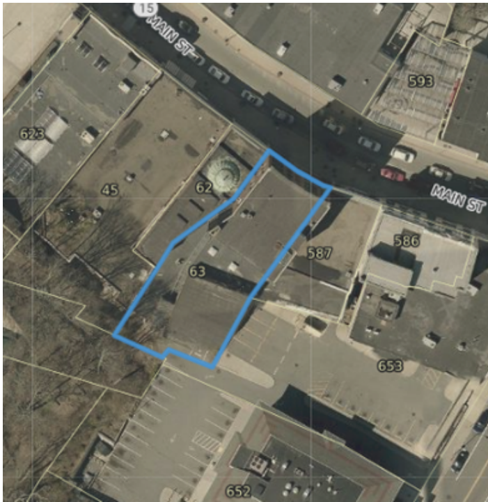
228 main 3