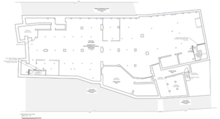
228 main 5