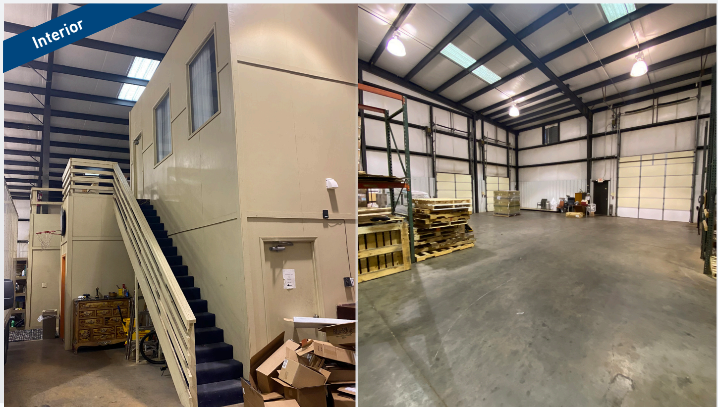
INTERIOR BUILDING | ±10,000 SF