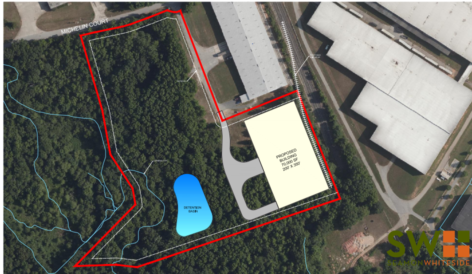
CONCEPTUAL SITE PLAN OPTION 1 ±70,000 SF 200' x 350'