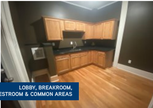
LOBBY, BREAKROOM, RESTROOM & COMMON AREAS