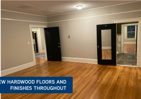
NEW HARDWOOD FLOORS AND FINISHES THROUGHOUT