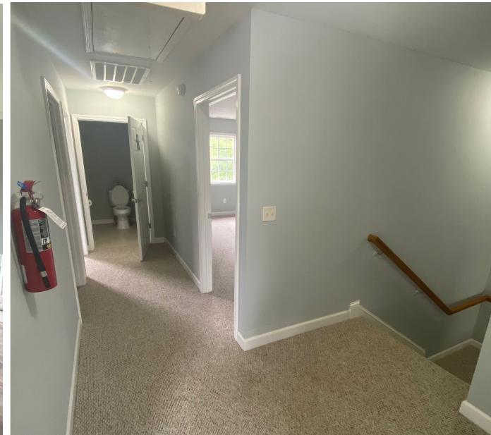
CLOCKWISE FROM TOP LEFT: Front office/reception area, kitchenette, upstairs hallway, downstairs hallway