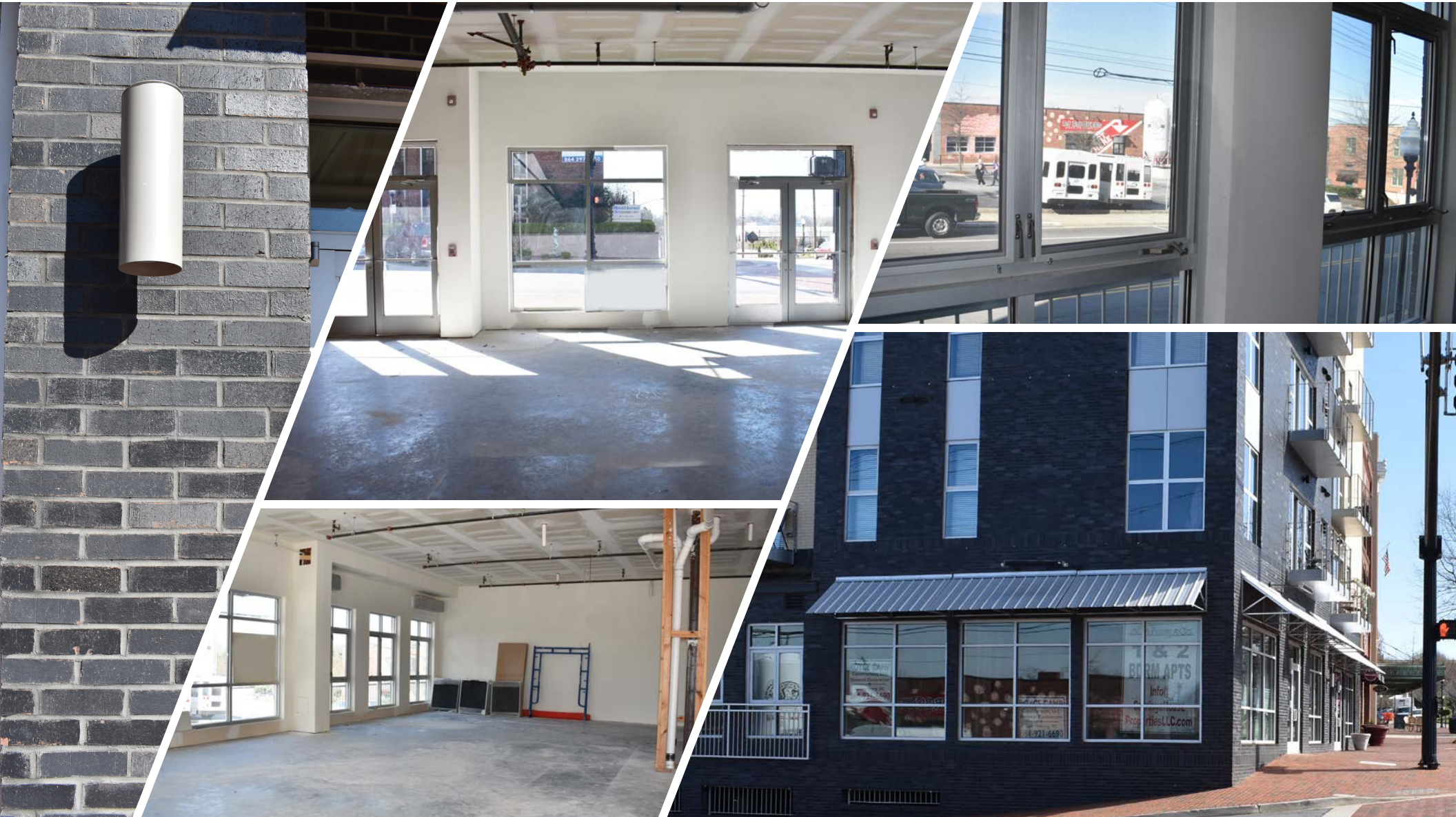
CLOCKWISE FROM TOP LEFT: Exterior lighting, front-facing view to Main Street, operational windows, corner of building from W. Main St, interior view.