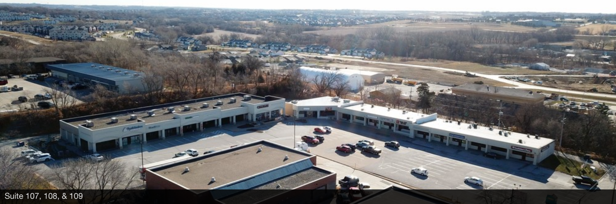
Suite 107, 108, & 109