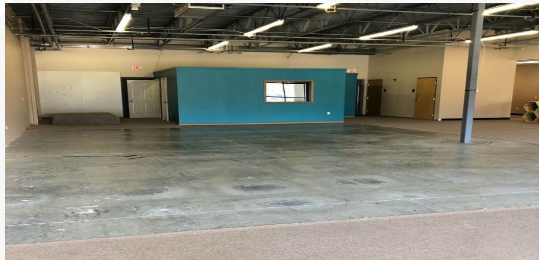
Suite 107, 108, & 109