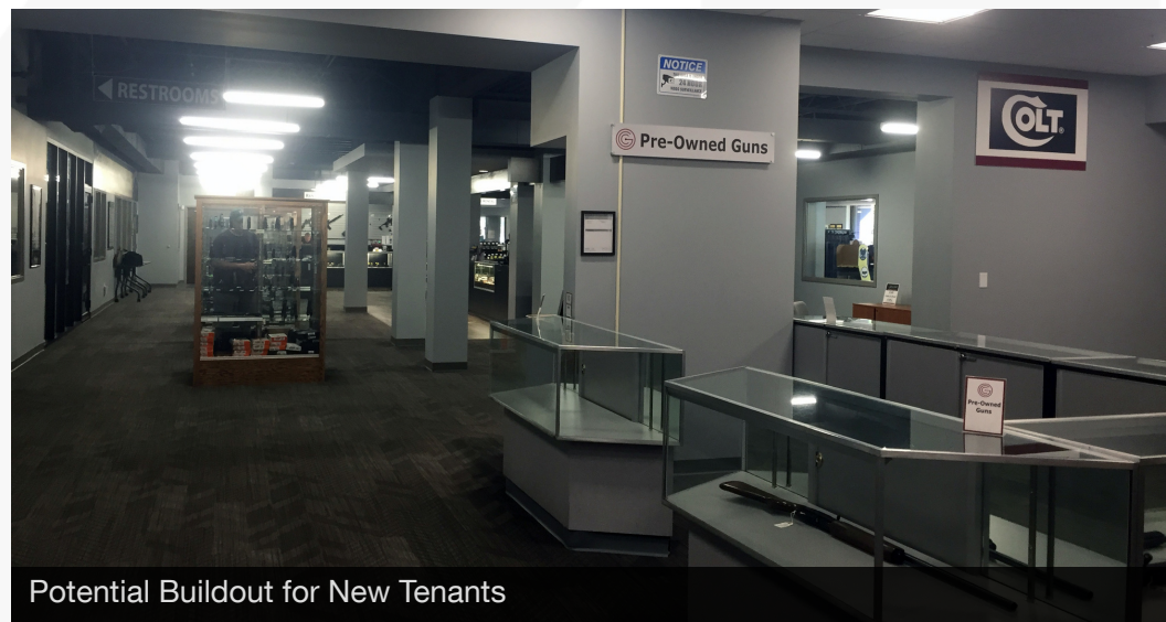
Potential Buildout for New Tenants