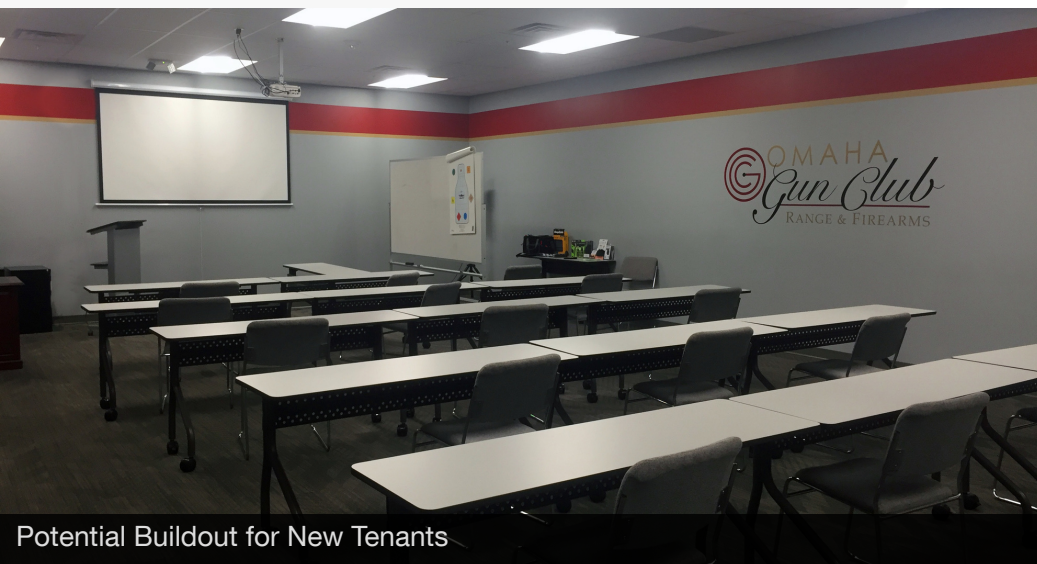
Potential Buildout for New Tenants