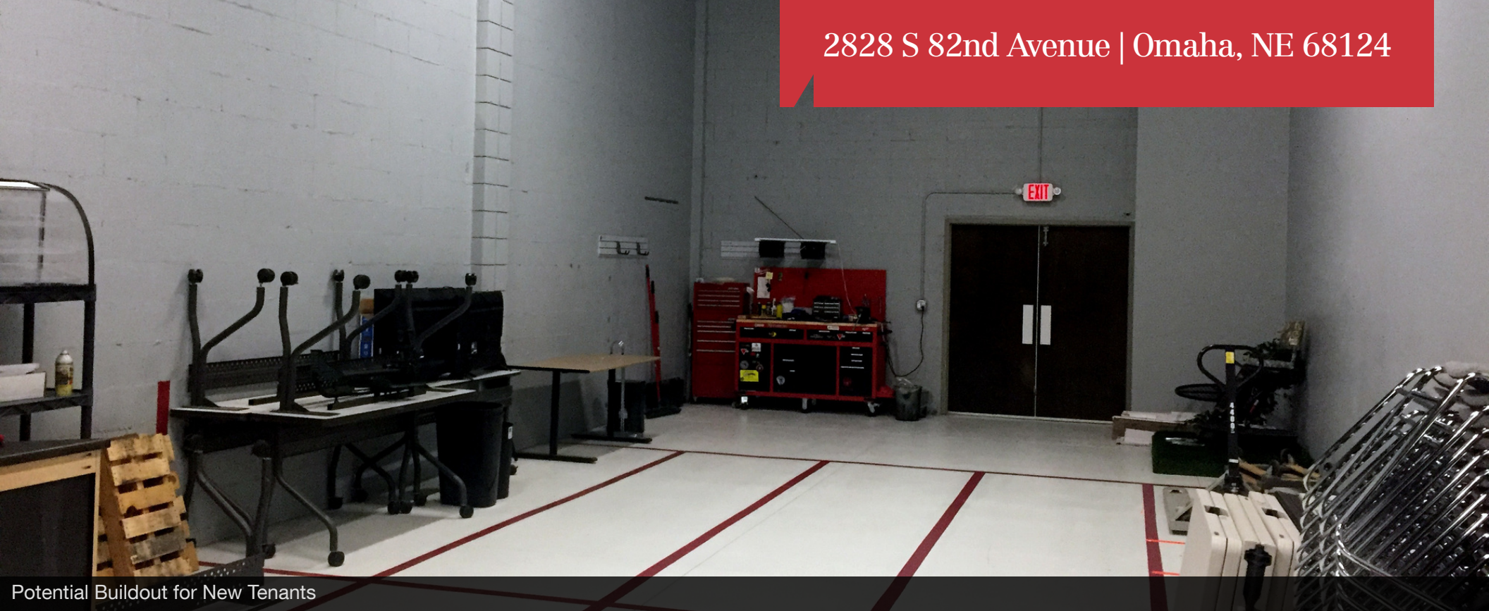
Potential Buildout for New Tenants