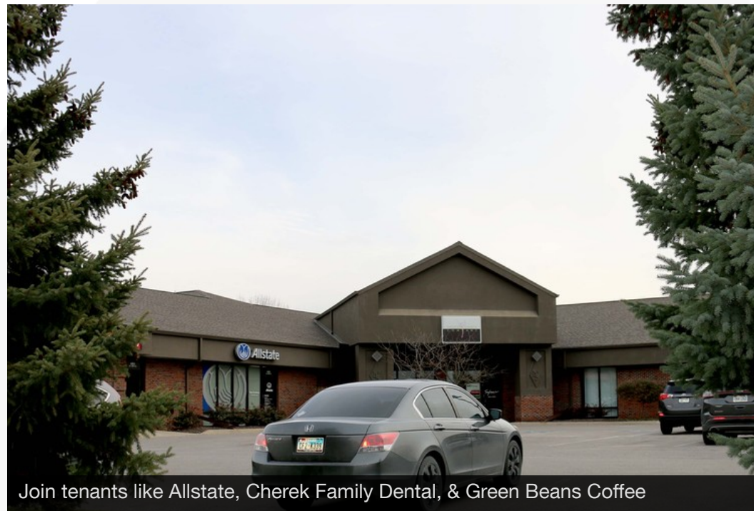
Join tenants like Allstate, Cherek Family Dental, & Green Beans Coffee