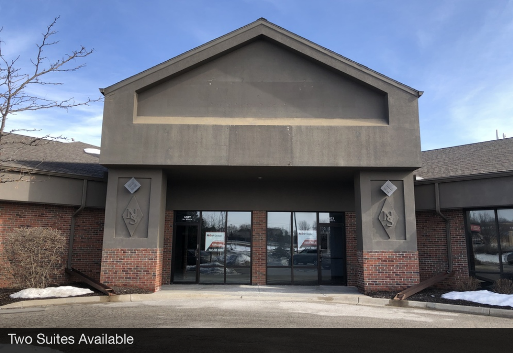
Two Suites Available