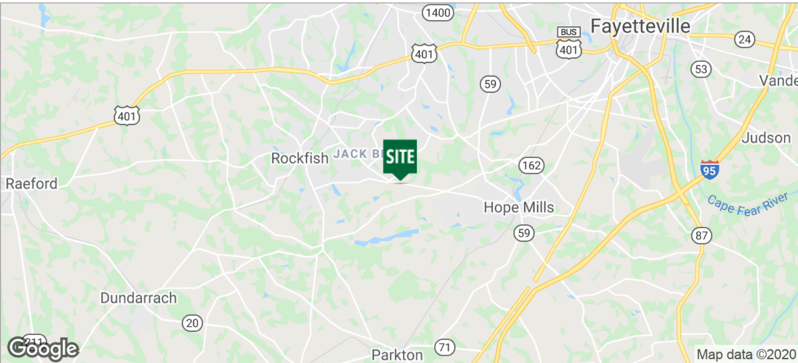
Map data ©2020