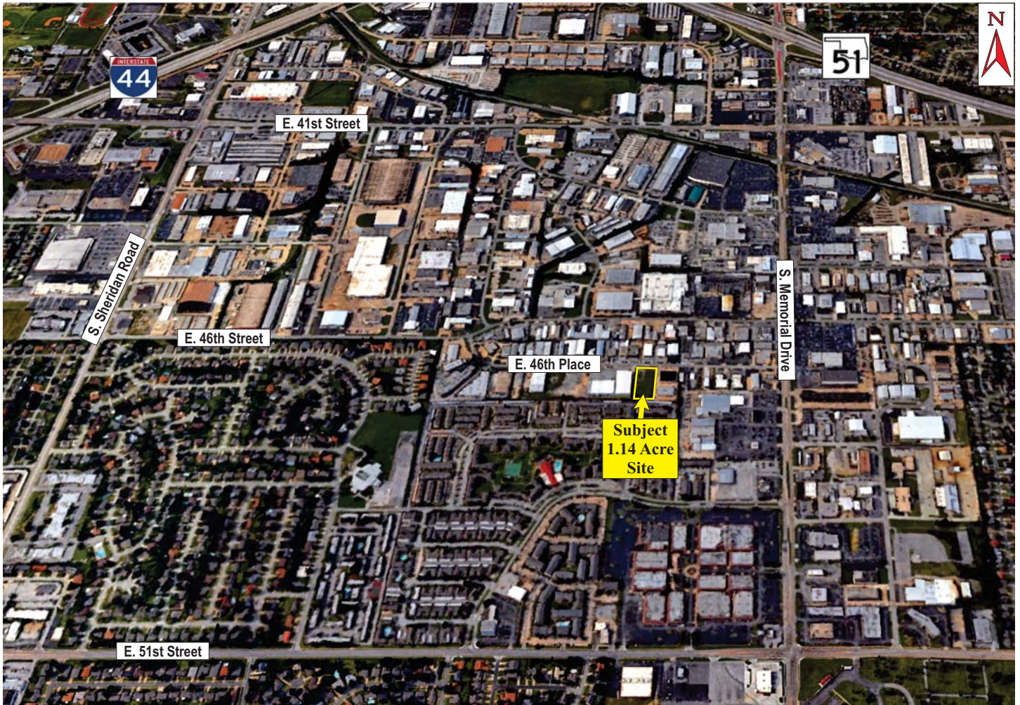
Greater Tulsa Area Map