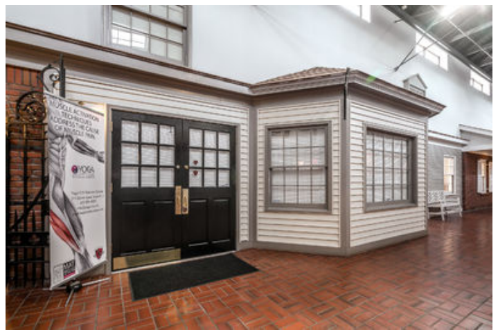
211 Clover Ln-27