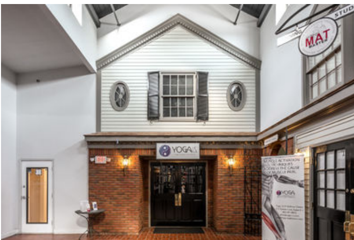
211 Clover Ln-25