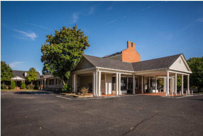
211 Clover Ln-11