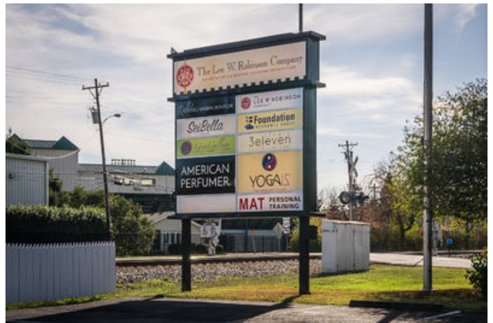
211 Clover Ln-22