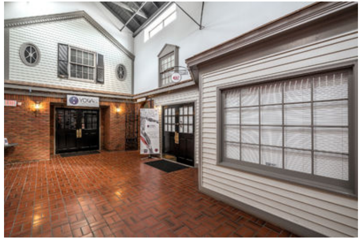
211 Clover Ln-26