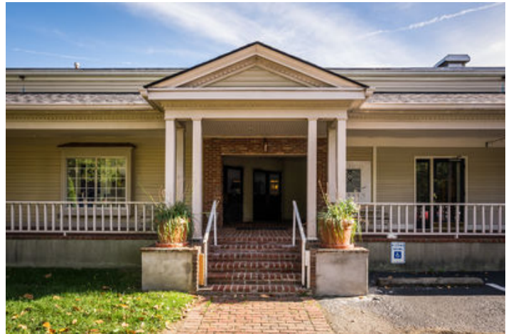
211 Clover Ln-13