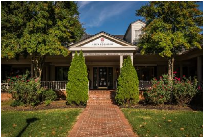
211 Clover Ln-14