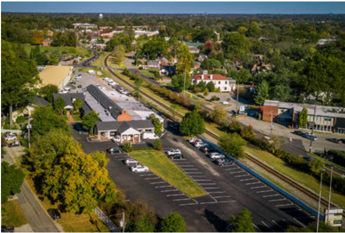
211 Clover Ln x-02