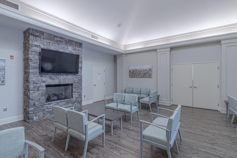
Shared waiting area