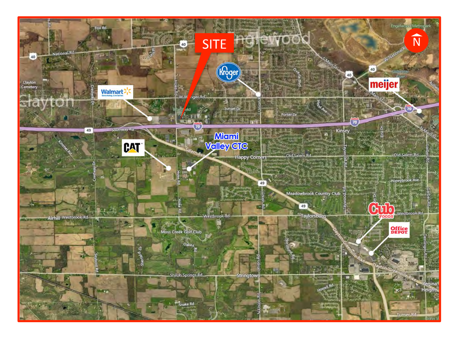
Trade Area Aerial