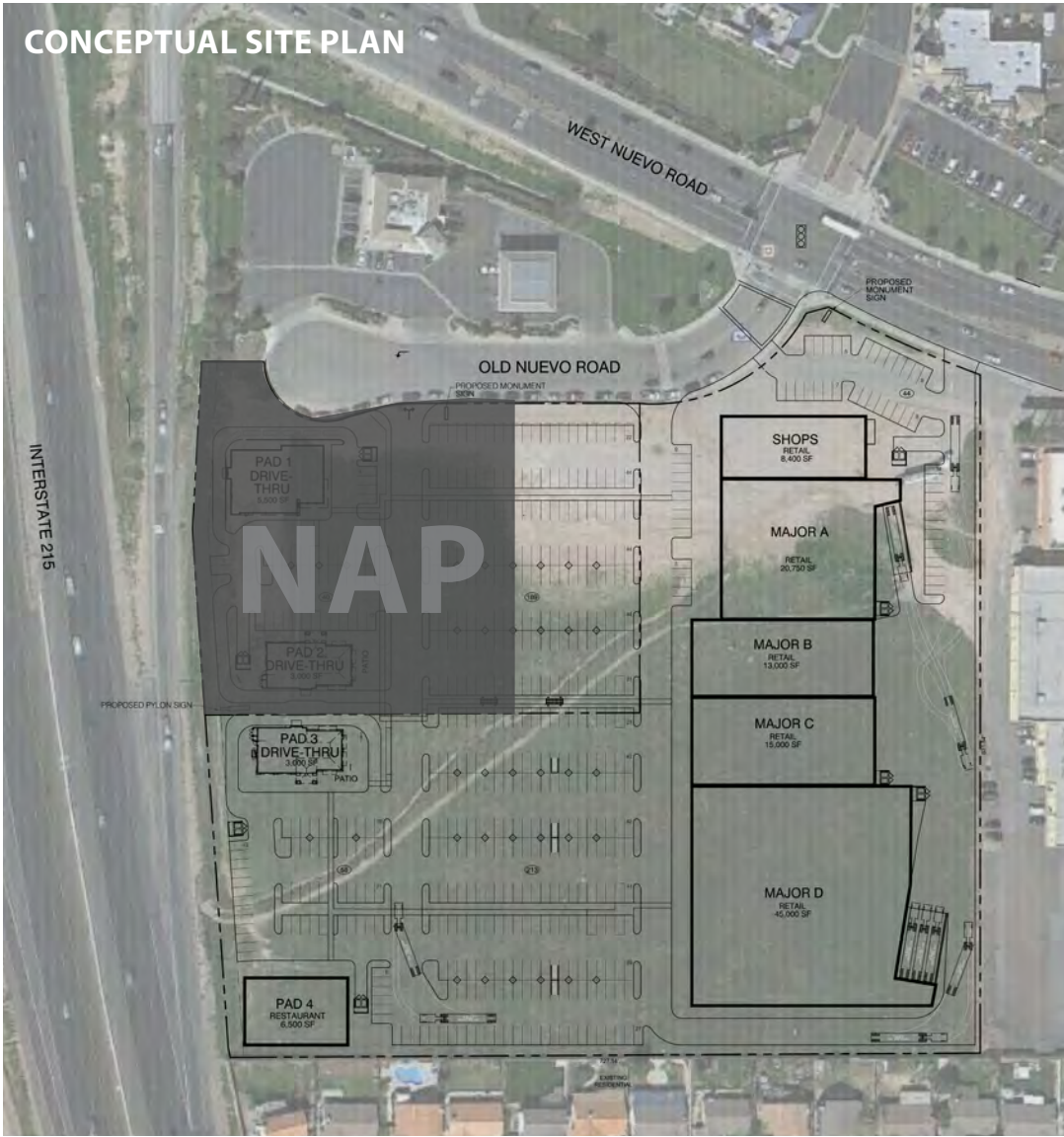
CONCEPTUAL SITE PLAN