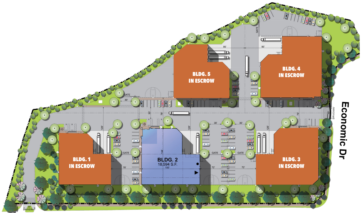
Van Buren Blvd