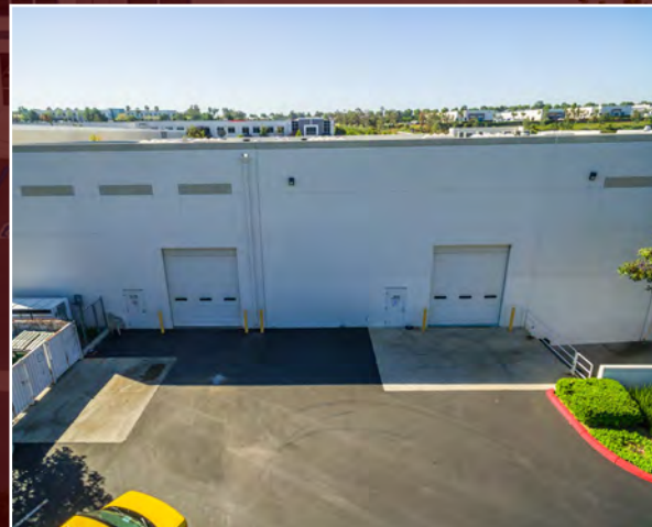
Good Truck Access