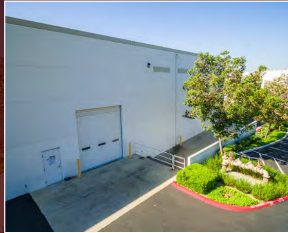
Dock High Loading