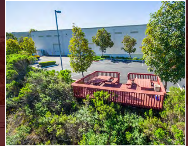
Deck Overlooking Open Canyon